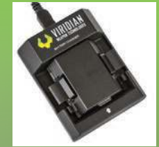
SINGLE BATTERY CHARGER