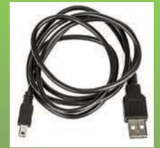
MICRO USB TO USB CHARGING CORD