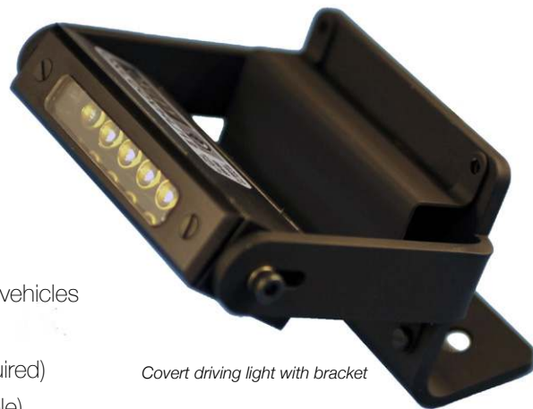
Covert driving light with bracket