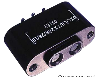
Covert convoy light

These lights look like the Oxley IR driving lights but are sealed for river use. Rear convoy light flashes and combines an IR and a visible white light.